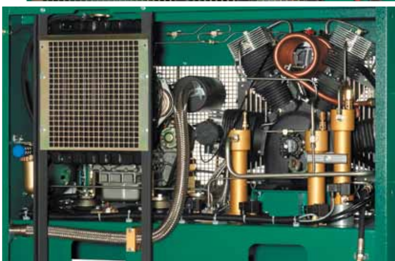
LW 570 D Rear view